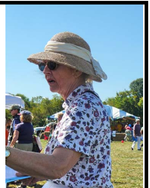
First Day of Knitting at Bear Tavern